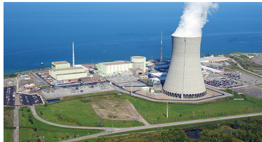
Nine Mile Point Nuclear Station