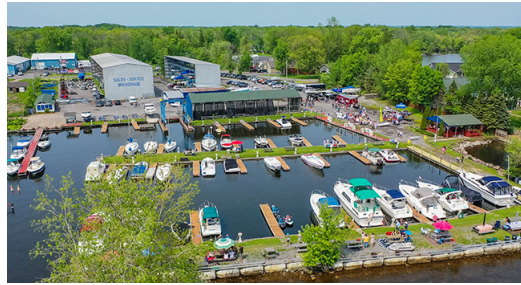
43 North Marina