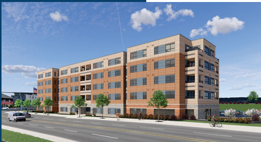
East Lake Commons